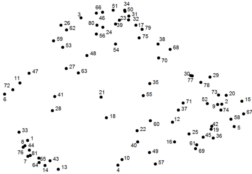
Figure 1. The point FUN MAP. This map pictorially displays the 81 fun-determinants that were brainstormed and sorted by players, parents, and coaches. Points that are located closer to one another on the map are more similar to one another than points located more distally from one another.